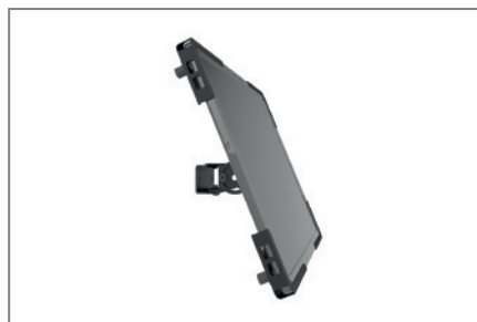
optionally combinable with: HA Tablet Wallmount (Item no.: 8798)