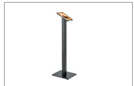
optionally combinable with: TSG-Stand (Item no.: 2580)