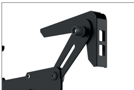
anti-theft thanks to frame elements that can be fixed via tools