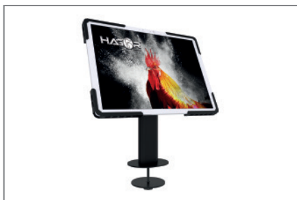
optionally combinable with: HA Tablet Stand (Item no.: 8797)